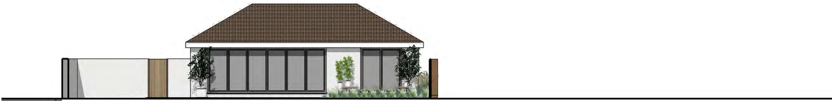
1 Proposed Front (South) Elevation

Do not scale this drawing. Work to figured dimensions only. This drawing is copyright of APS Designs and should only be reproduced with their express permission. Check all dimensions on site. Any discrepancies should be reported to APS Designs prior to commencement.