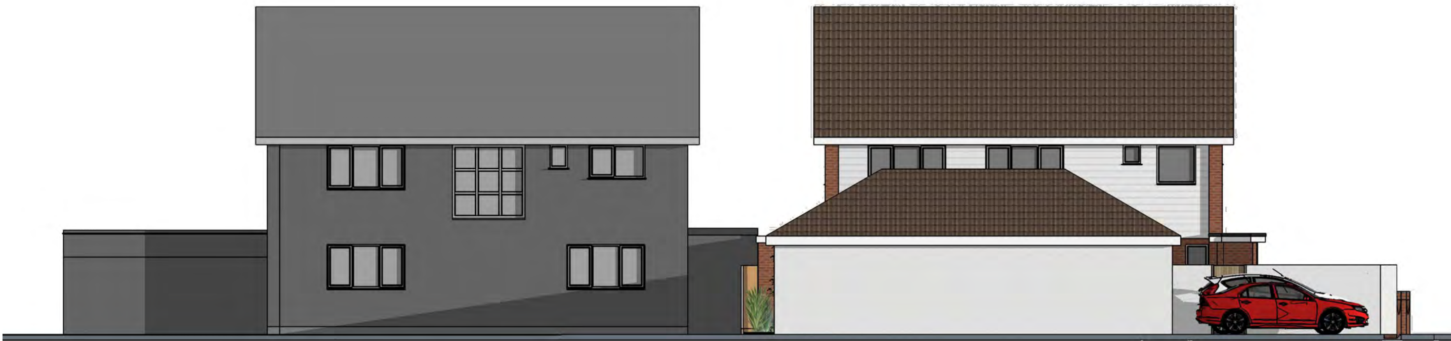
2 Proposed Rear (North) Elevation